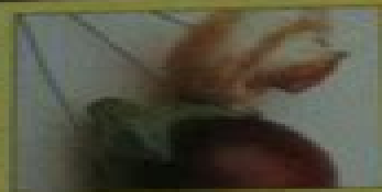
WIRES AND WIRING