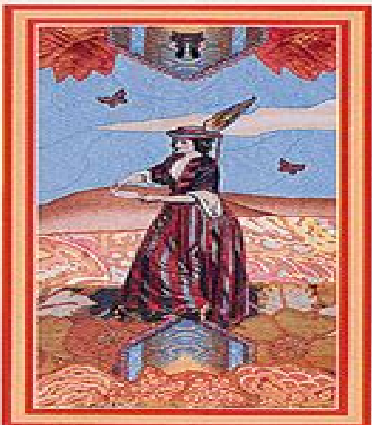
PRINCESS OF WANDS