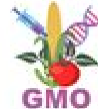
GMO GMO food