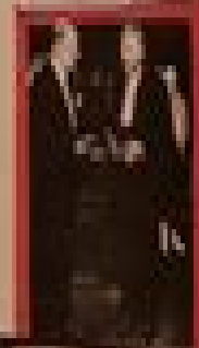
Albert Einstein and Mileva Marić, 1903