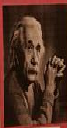
Albert Einstein, 1905