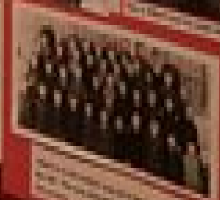
Albert Einstein and other scientists, 1929