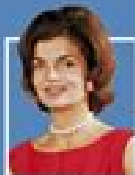
JACQUELINE BOUVIER (DIED 1994)