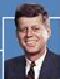
JOHN F. KENNEDY SR. (DIED 1963)