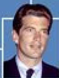
JOHN F. KENNEDY JR. (DIED 1999)