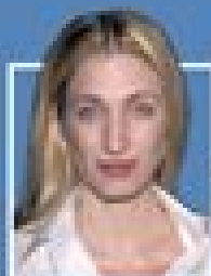
CAROLYN BESSETTE (DIED 1999)