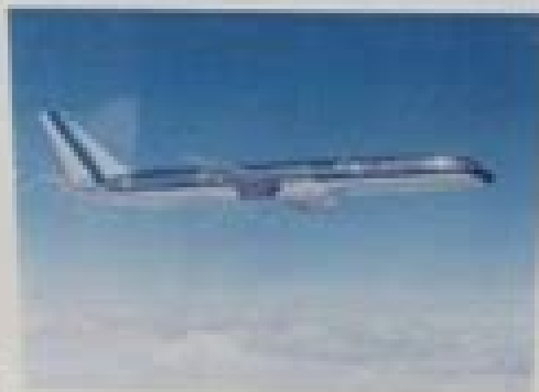
THE NEW 747-400