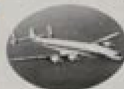
AIRBUS A320neo 1988 - 1990