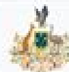
Coat of arms