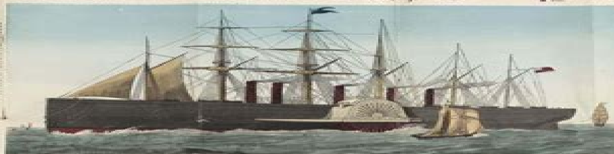
THE GREAT EASTERN.