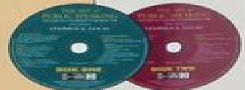
CD-ROMs with Video