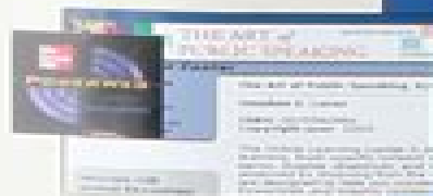
Online Learning Center