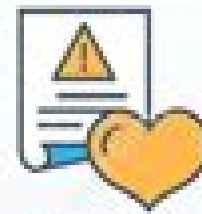
Norms and Values