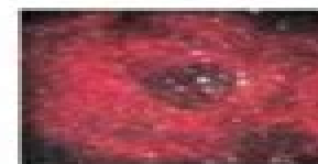
Rosette Nebula in the constellation Monoceros

The clearest recognition guides available