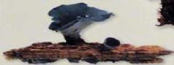
Green Stain Cup