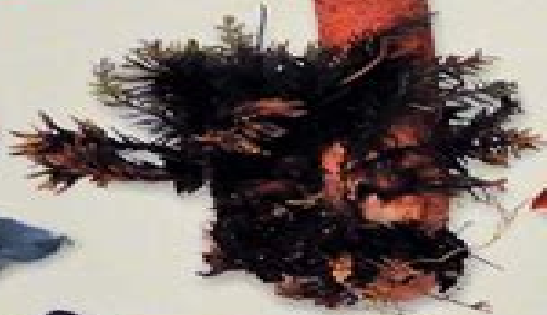
Mottled Poison Cort