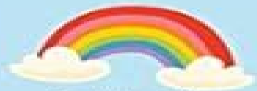
Rainbow / Радуга (ra-du-ga)