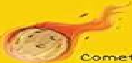
Comet / Комета (ko-me-ta)