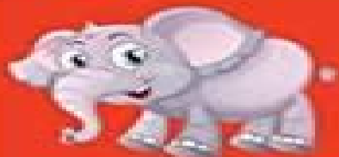
Elephant / Слон (slon)