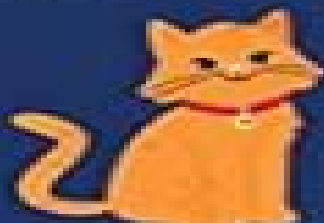
Cat / Кот (kot)