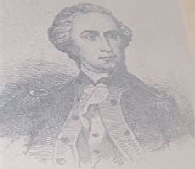
JOHN PAUL JONES

BOSTON : MDCCCXCV PRINTED EXCLUSIVELY FOR MEMBERS OF THE BIBLIOPHILE SOCIETY