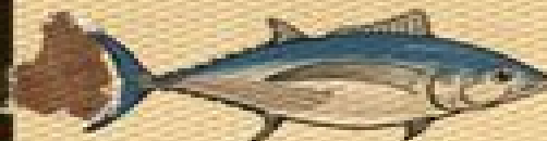
ALPHACORE Genuine Italian Design