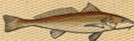
COMPTON DE MINNESOTA