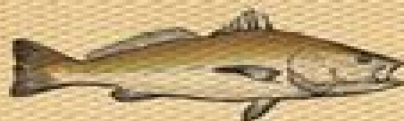
White Sea Bass