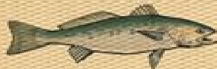
WEAFTISH OR SOUTHEASTERN