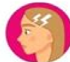
CHANGES OF MOOD