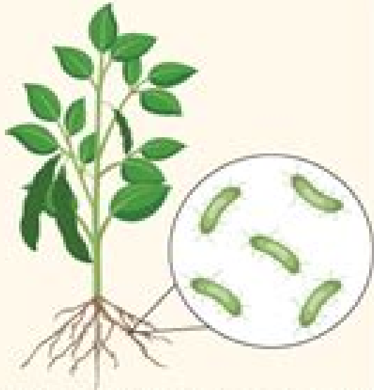
(Nitrogen-fixing Bacteria and Leguminous Plants)

A long-term association between two organisms of different species