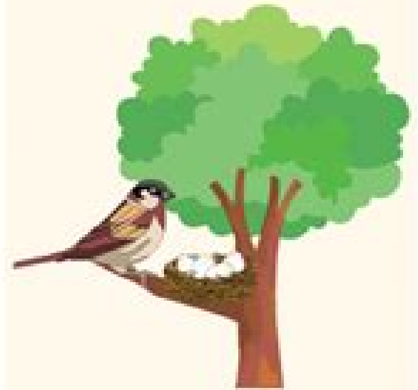
(A bird and a Tree)