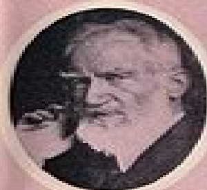
George Bernard Shaw