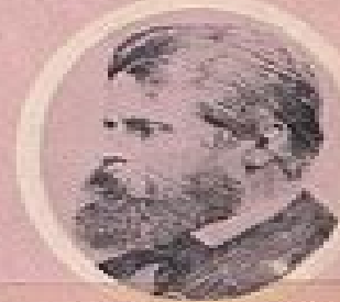
Wilfrid Scawen Blunt