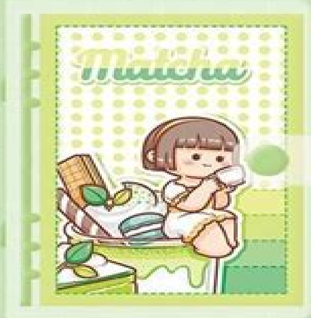
1 x binder cover