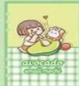
5 x index paper