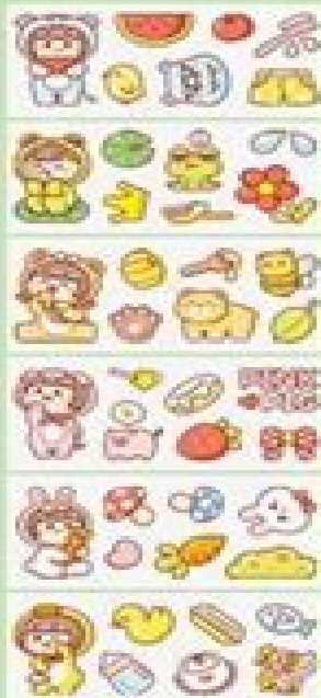
6 x PVC sticker