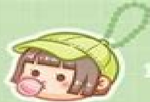
1 x pendant