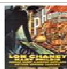
The Phantom of the Opera 1929

43005-8 Noble—Color Your Own Great Flower Paintings $3.95