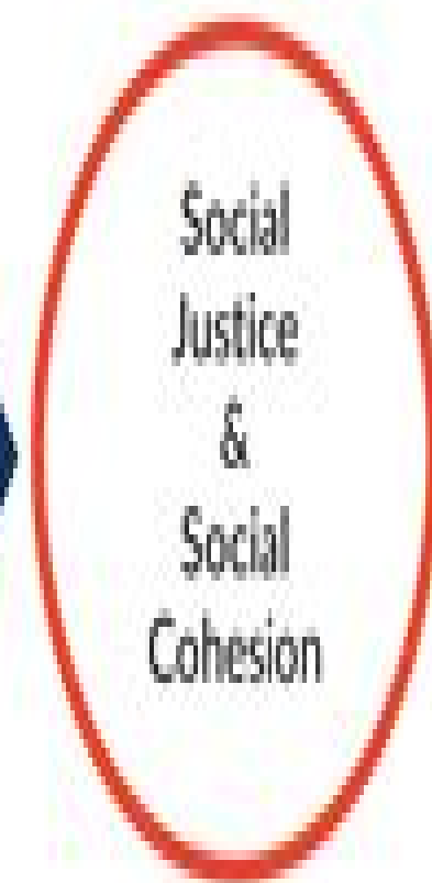
Figure 1: Unlocking Service Delivery for Society