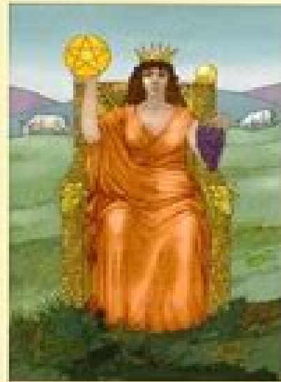
QUEEN OF PENTACLES