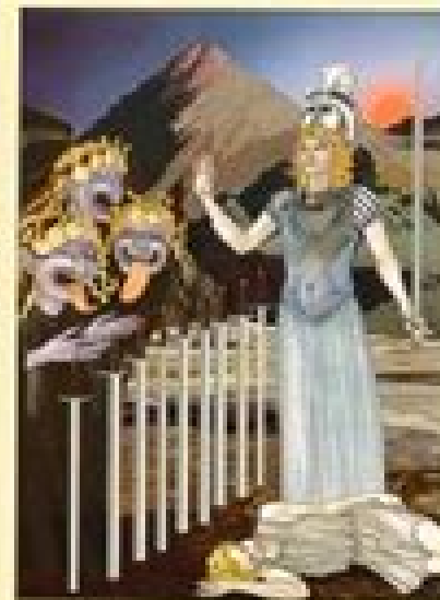
TEN OF SWORDS