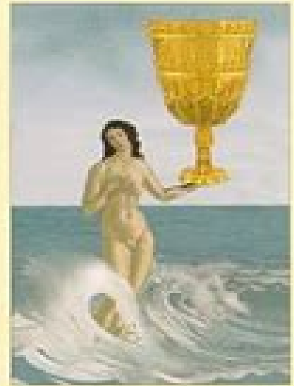
ACE OF CUPS