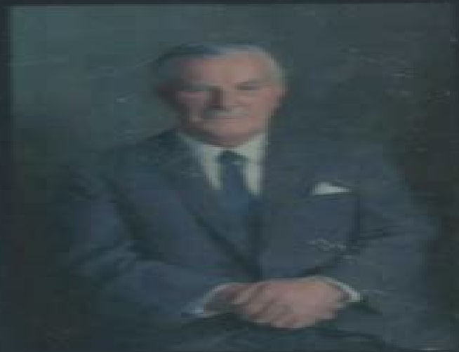
SIR ARTHUR STEPHENSON AUSTRALIAN ARCHITECT