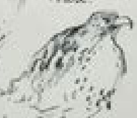
The hawk stayed by the hill. Stopped to take prey and she called out. This hawk later she was still there.