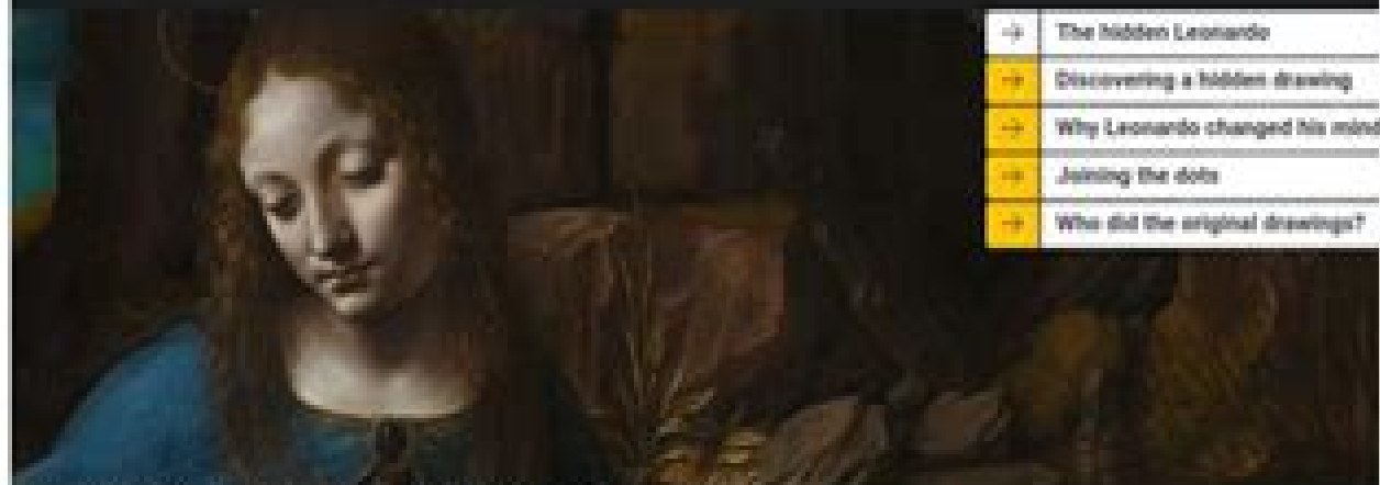
Leonardo da Vinci, 'The Virgin of the Rocks', about 1491/2-9 and 1506-8

Uncover the hidden painting behind one of the most celebrated masterpieces at the Gallery, Leonardo's 'The Virgin of the Rocks'.