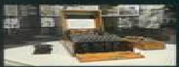
BREAKING THE CODES