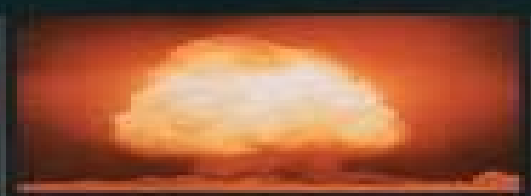
SCIENCE, THREATS & TRAITORS