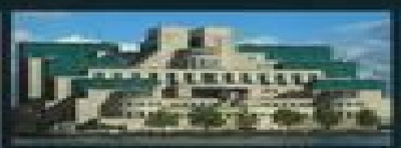
21ST CENTURY INTELLIGENCE