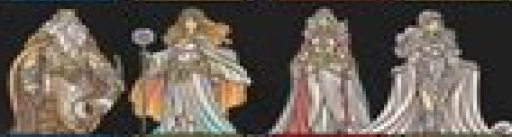
MOROZKO LADA ZORYA KORYMBOS