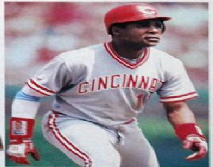
Barry Larkin Cincinnati Reds