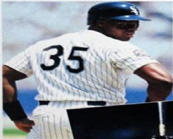
Frank Thomas Chicago White Sox