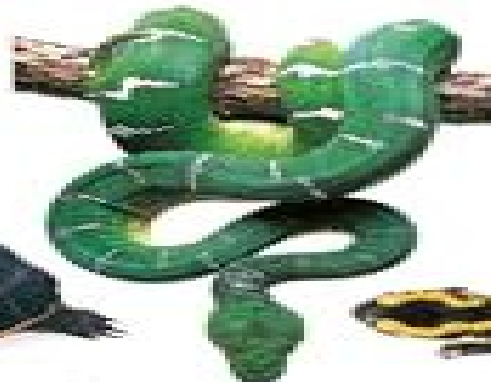
Emerald Tree Boa