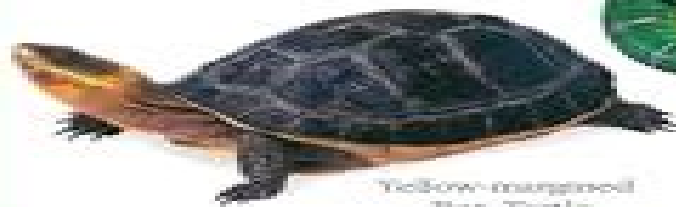
Yellow-margined Box Turtle