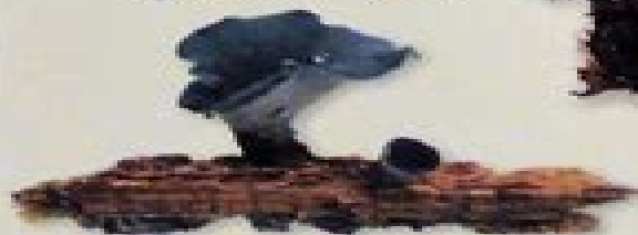
Green Stain Cup