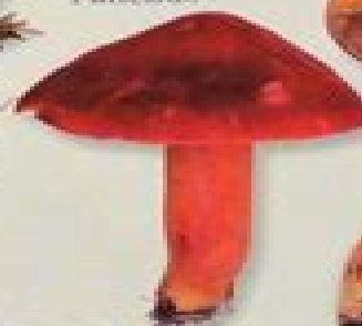
Crimson Wax Cap