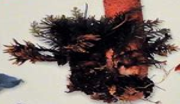
Mottled Poison Cort