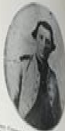
Above left: General Carl Ludwig von D. The Prussian General of the 1st Division of the 1st Army Corps of the 1st Army of the North German Confederation in 1866. The photo was taken in 1866. The photo was taken in 1866. Above right: The photo was taken in 1866. The photo was taken in 1866. Below left: The photo was taken in 1866. The photo was taken in 1866. Below right: The photo was taken in 1866. The photo was taken in 1866.