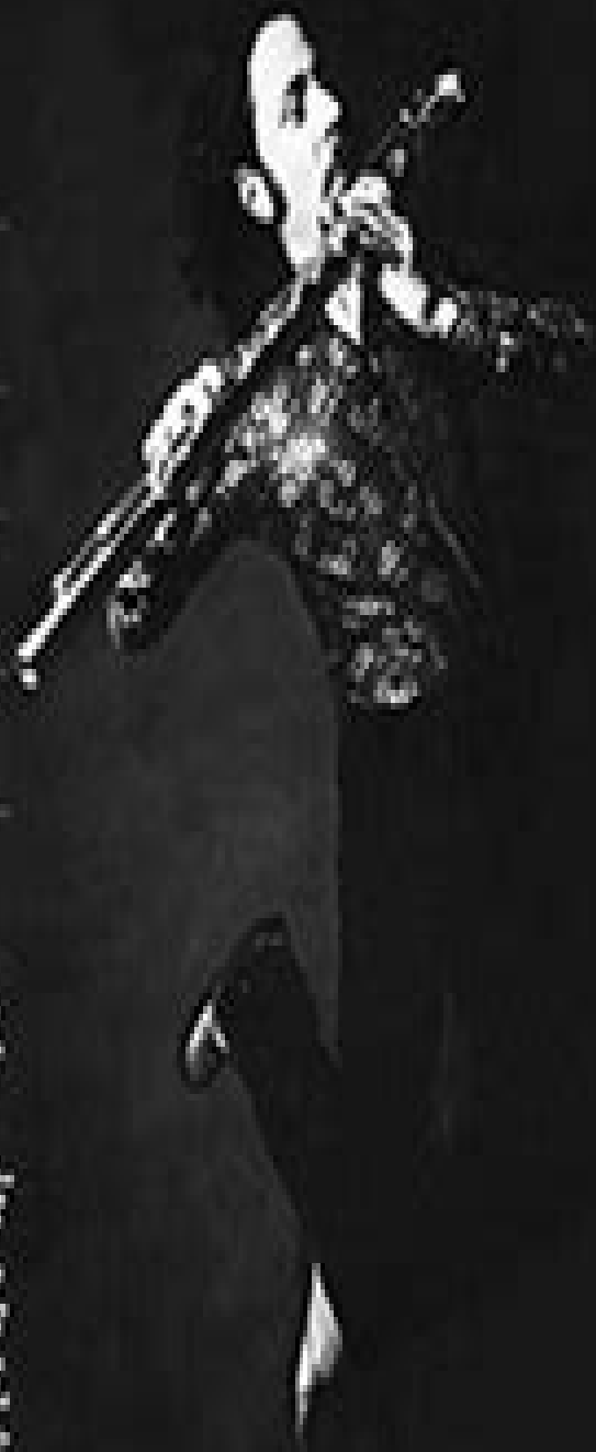
STEIG

The first time I saw Jeremy Steig was in 1971, at the New York City Public Library. He was playing the flute, and I was sitting in the audience. I was struck by his playing, and I was struck by his appearance. He was a young man, and he was playing with a confidence and a skill that I had never seen before. I was struck by his playing, and I was struck by his appearance. He was a young man, and he was playing with a confidence and a skill that I had never seen before.