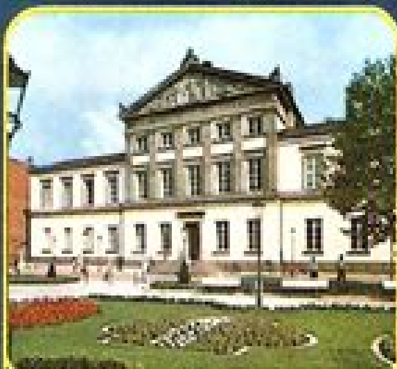
Aula der Georgia-Augusta