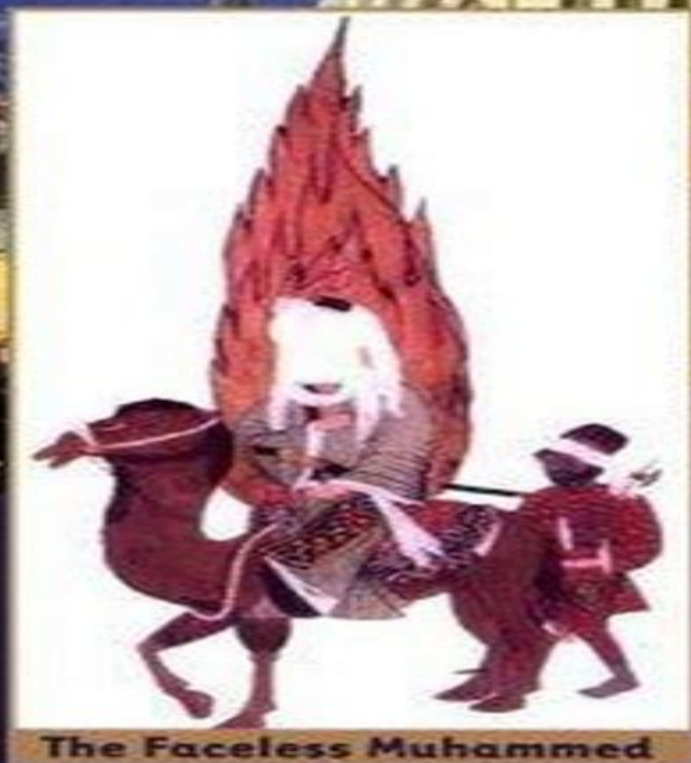
The Faceless Muhammed