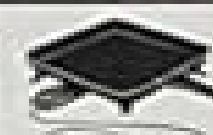
Electric Fly Pats