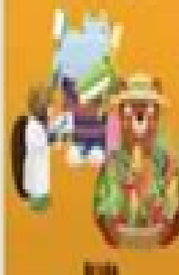
Illustration by [unintelligible]