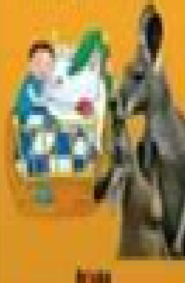
Illustration by [unintelligible]