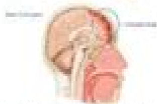
Diagram illustrating the anatomical structures of the larynx and trachea, including the larynx, trachea, esophagus, and thyroid gland.