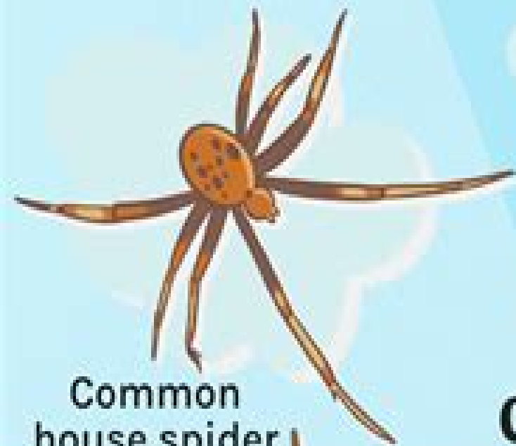
Common house spider