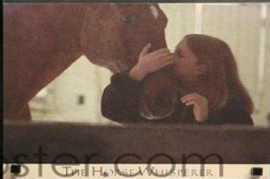
THE HORSE WHISPERER