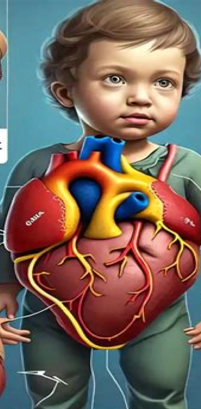
Tetralogy of Fallot