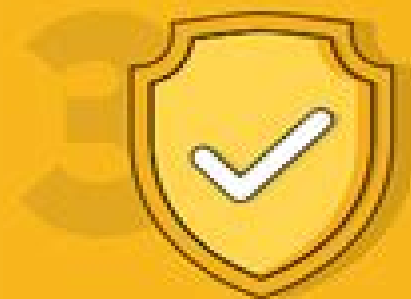
Surety Company that issues and backs the bond