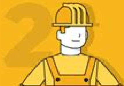
Contractors known as the bond principal