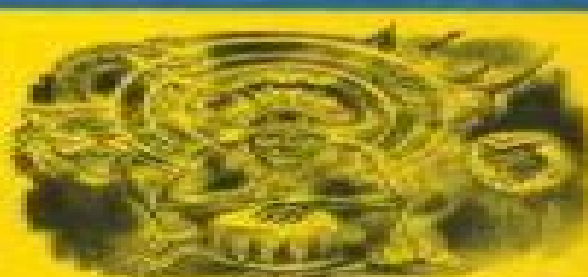
The witch doctor wizard— so he stops or bests?