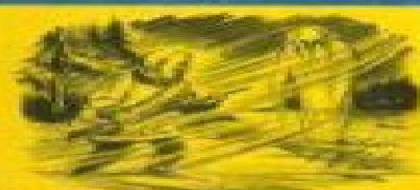
The wrathful wrath—sure death to all who offend him.