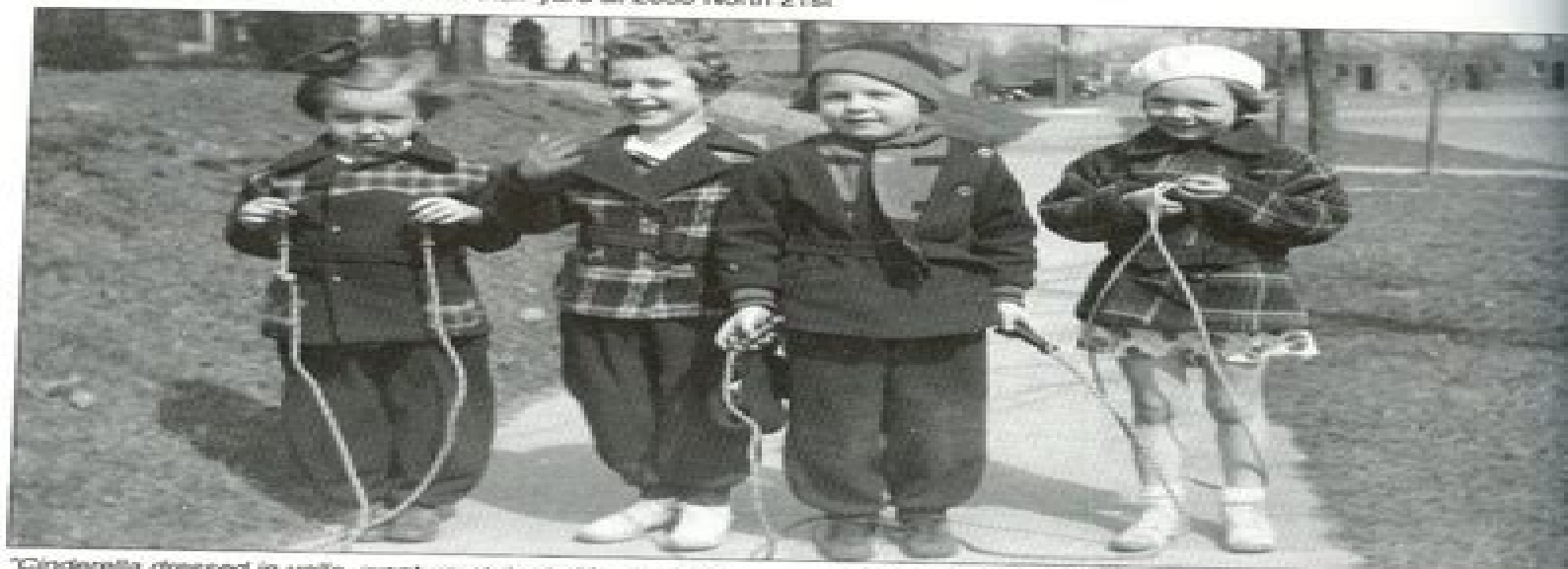
"Cinderella dressed in yella, went up-stairs to kiss her fella, Made a mistake, kissed a snake. How many doctors did it take...1...2...3...?"

Street in 1954 are enjoying the familiar metal set that became popular in the 1940s.