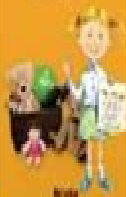
Illustration by [unintelligible]