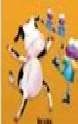
Illustration by [unintelligible]