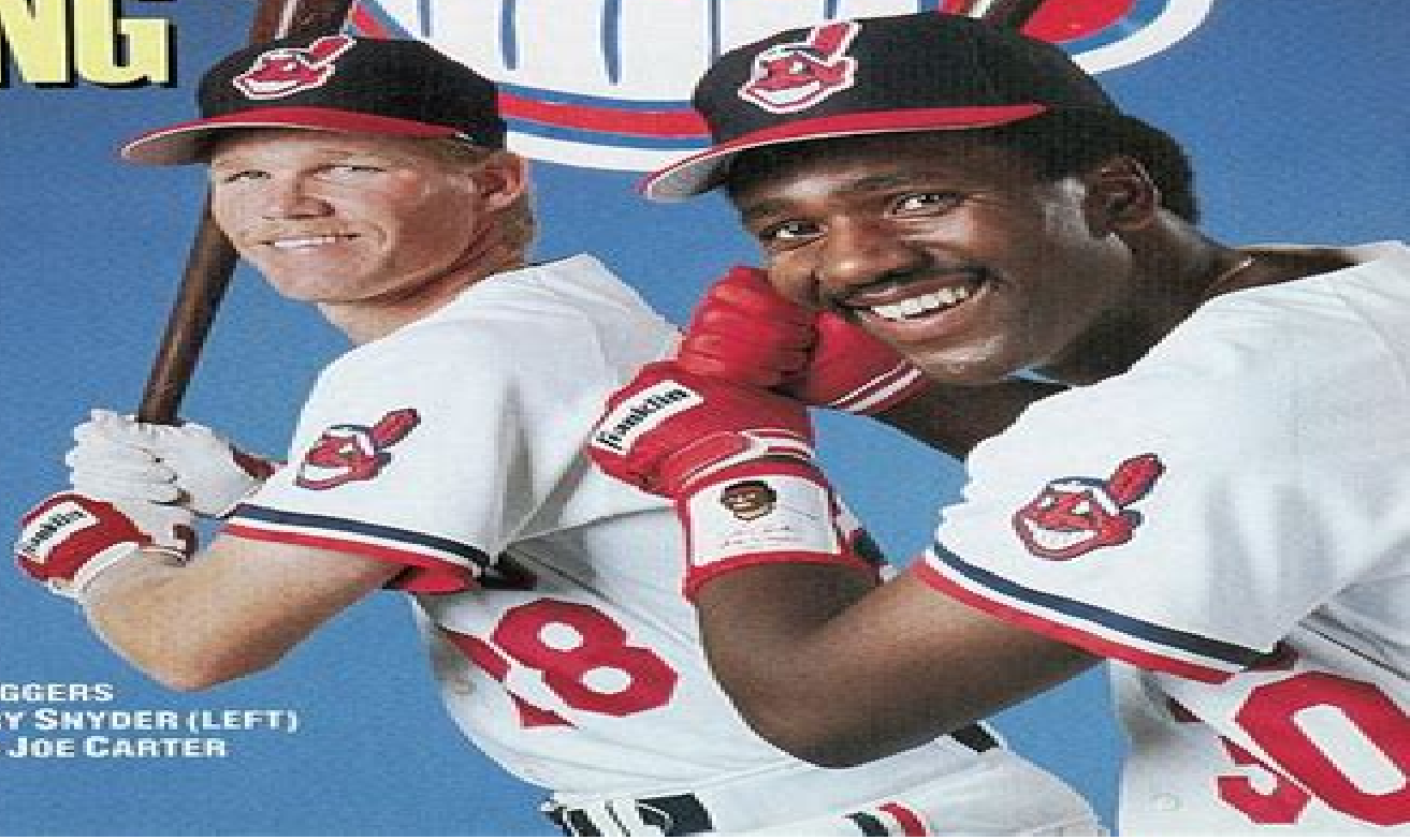
SLUGGERS CORY SNYDER (LEFT) AND JOE CARTER

Reliving Game 6: How the Red Sox Blew the 1986 World Series