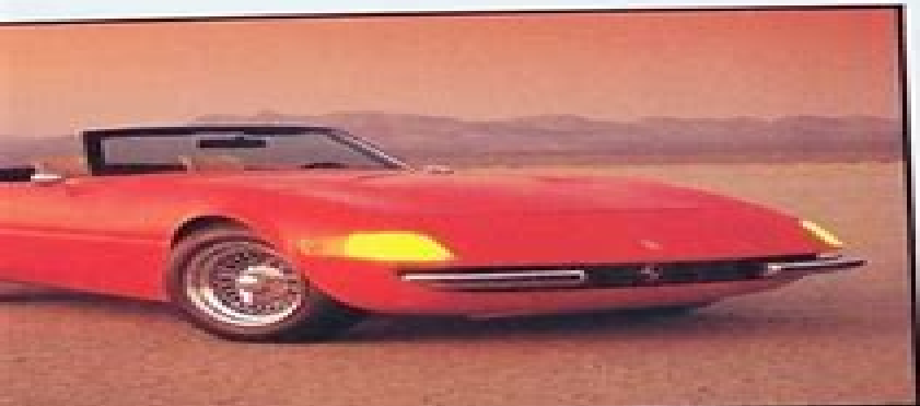
Ferrari 365 GTB/4 Daytona