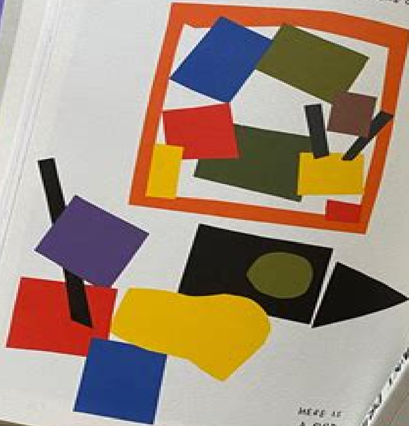
HERE IS A SNAIL