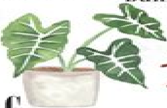
G Green Velvet