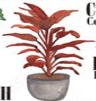
H Hawaiian Ti Plant