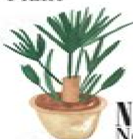
N Needle Palm