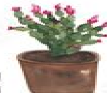
E Easter Cactus