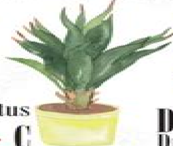
C Century Plant