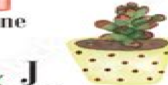
J Jelly Bean