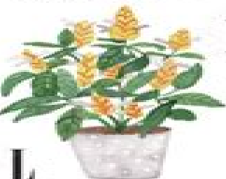
L Lollipop Flower