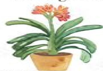
K Kaffir Lily