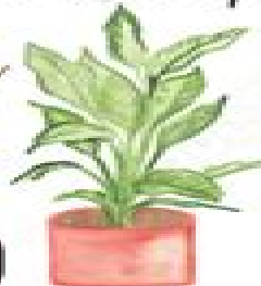
D Dumb Cane