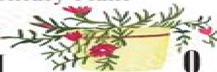
I Ice Plant