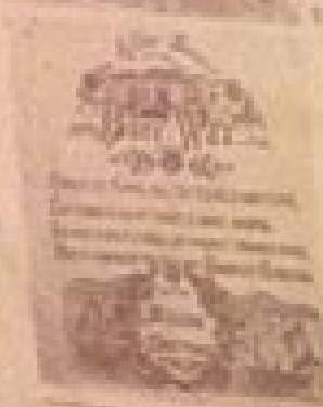
A trench near Buller's camp, showing the position of the British soldiers

"A wonderfully complete picture of the campaign and details of every day during the 'Commando' action of the 1899-1900 war, the memory of which is still so fresh in our minds. John Bull and Agnes Bull are really welcome back to the world."