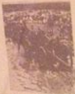
General Buller's army at the Tugela River