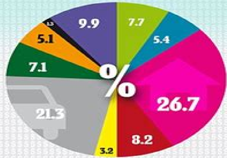
Middle Class: $50,000-$69,000